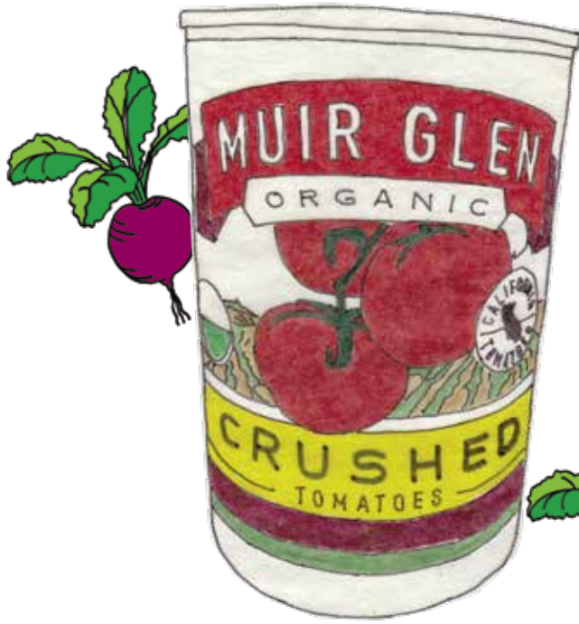
Muir Glen CANNED TOMATOES all 14 - 15 oz varieties 4/$5