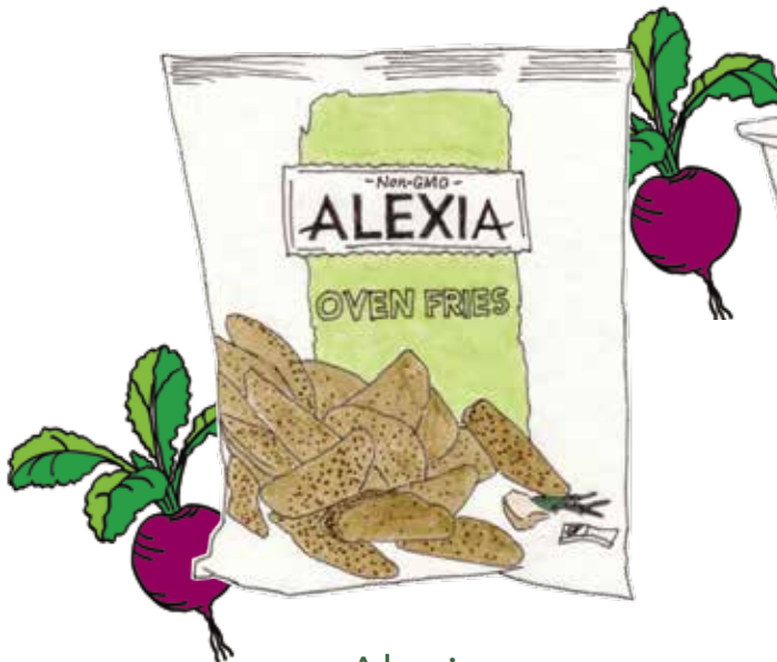
Alexia FROZEN POTATOES all varieties $2.99