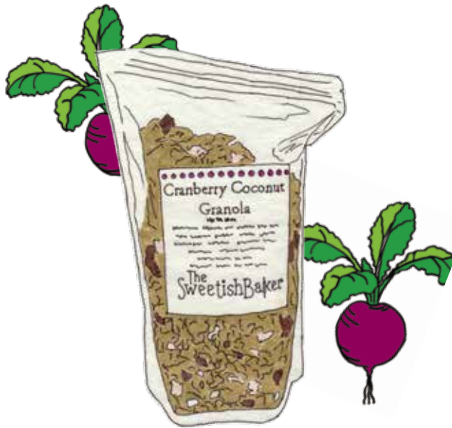
The Sweetish Baker GRANOLA all varieties $6.99

There are over 800 products on sale in our stores in January, and we've picked our very favorites. Don't forget to look for the BEET all month long!