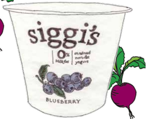
Siggis YOGURT 5.3 oz all varieties 4/$5