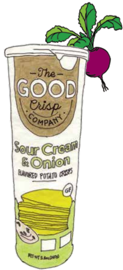
The Good Crisp POTATO CRISPS all 5.6 oz varieties 2/$5