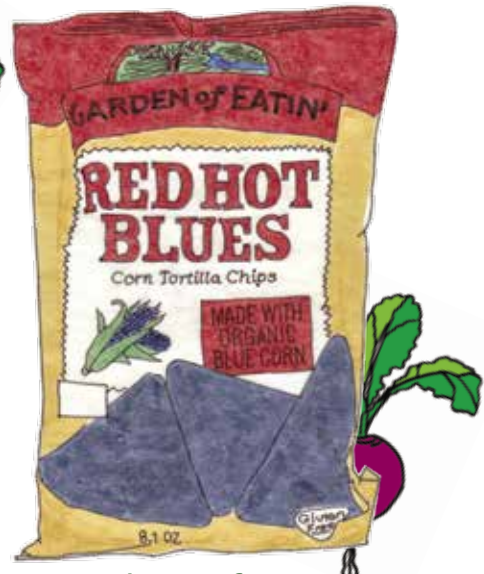
Garden of Eaten TORTILLA CHIPS all 8.1 oz varieties 2 for $5