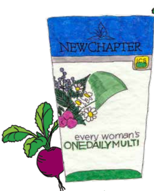
New Chapter MULTIVITAMINS all varieties 25% off