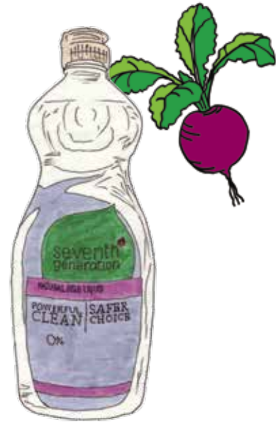
Seventh Generation DISH SOAP all varieties $2.99